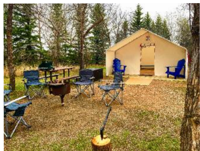
Camp-Easy equipped campsites available in three provincial parks

For those who are new to camping and looking for a more guided experience, Sask Parks is offering a Learn to Camp program in Camp-Easy