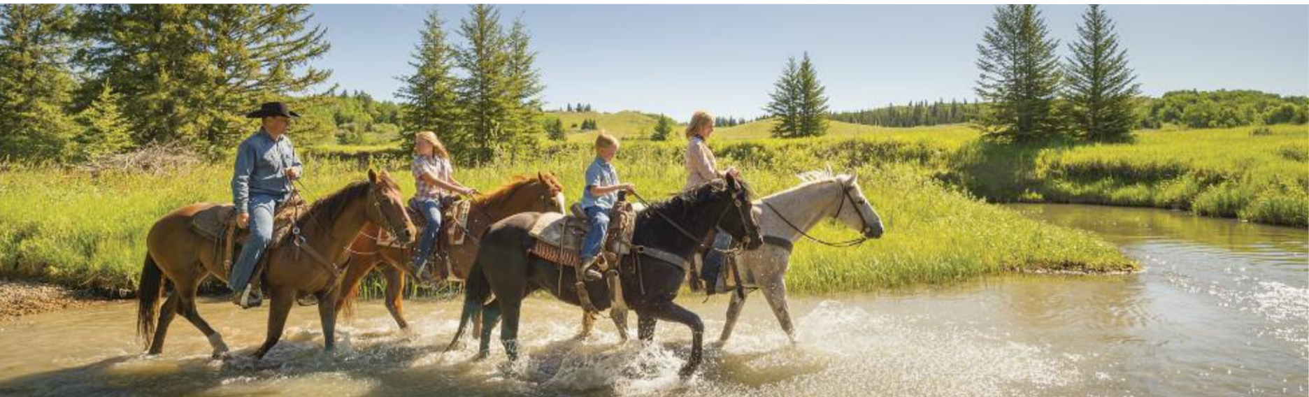
Cypress Hills Interprovincial Park

Travel figures for 2017, released in the spring, signalled encouraging news for Saskatchewan's tourism industry. Total travel expenditures reached $2.37 billion, an increase of 8.2 per cent over the previous year. This new total suggests a rebound for the tourism economy, comparable to growth levels achieved in 2010-2014.