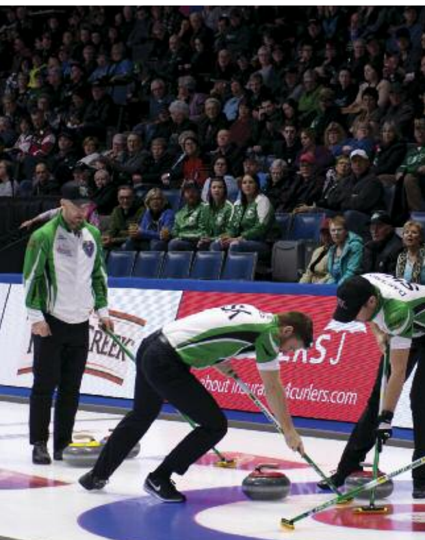
2018 Tim Hortons Brier, Regina