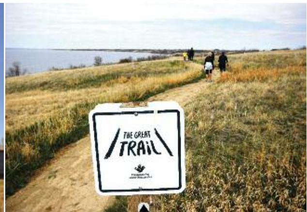
Elbow Trail, along Lake Diefenbaker

As the 2018 Saskatchewanderer, I am the official travel blogger and adventurer for Saskatchewan. It's a dream job, as I get to showcase Saskatchewan's diverse people, places and businesses all year long!