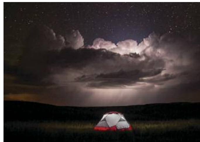
2017 ExploreSask Photo Contest Grand Prize winner: Dallas Hordichuck

Photographers may also submit entries through Instagram and Twitter by using the #ExploreSask category hashtags. For complete contest rules and to submit your entry, visit TourismSaskatchewan.com/PhotoContest . The deadline for entries is September 16, 2018.