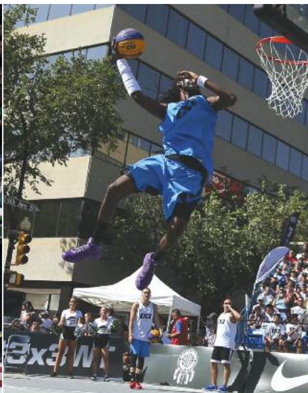
FIBA 3x3 World Tour, Saskatoon