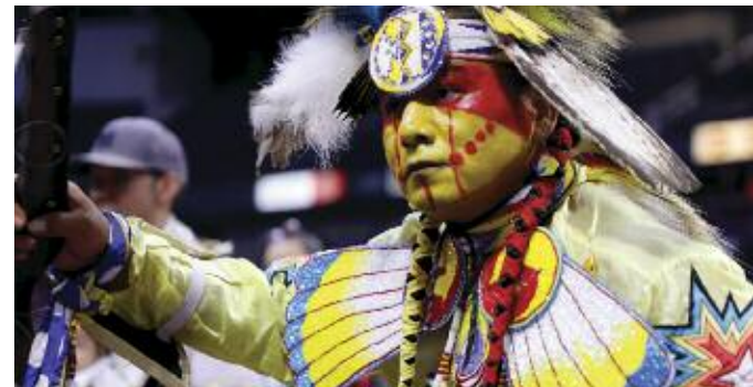
2018 First Nations University of Canada Spring Powwow