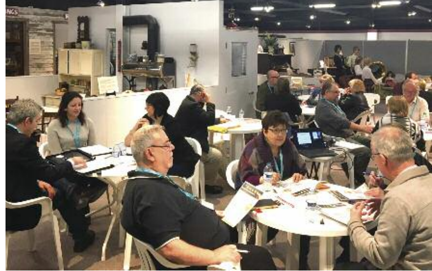
Tourism Saskatchewan hosted Assiniboia and area delegates on March 15.

Tourism Saskatchewan extends thanks to Tourism Talks attendees from the communities of Assiniboia, Bengough and Mossbank.