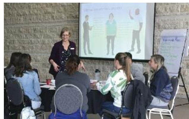
Service First delivered to YQReady participants in May

"Working with Tourism Saskatchewan to develop YQReady provided excellent additional training