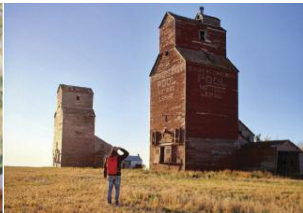
Lepine elevator, near Wakaw