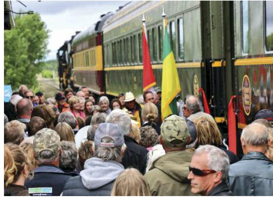
Wheatland Express Excursion Train departs from Cudworth on June 2.

Given that tourism is a fiercely competitive industry, there is an obvious focus on research, innovation and connecting with our key markets on the channels they access most. Effective digital engagement and influence requires a thoughtful, strategic approach and an ability to adapt to change and employ different tactics. At the same time, we cannot overlook customer service. Communicating with and motivating travellers via the digital world is one thing; delivering exceptional customer service and great guest experiences is another. Travel memories are made when there are people in the picture – welcoming operators and employees, proud community ambassadors and creative individuals with a wide-angle vision for our industry.