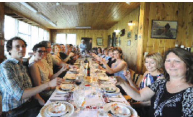
Farm to Table dinner, Carrot River