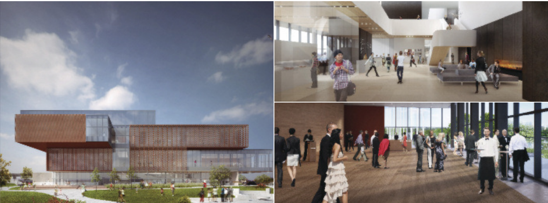
Remai Modern, architectural renderings of exterior (left), interior (top right), Riverview Room (bottom right)

"The artist is a receptacle for emotions that come from all over the place: from the sky, from the earth, from a scrap of paper, from a passing shape, from a spider's web."