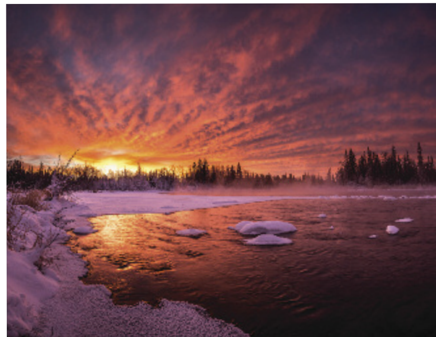
2016 ExploreSask Photo Contest, Woods and Water category winner, Corey Hardcastle, near Air Ronge and La Ronge

For complete contest rules and to submit your entry, visit TourismSaskatchewan.com/PhotoContest . Photographers may also submit entries through Instagram and Twitter by using the #ExploreSask category hashtags. Submissions will be displayed in an online gallery open for comments or to share with friends.