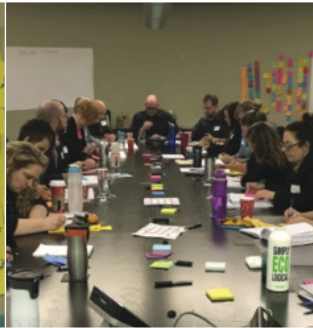
Tourism Saskatchewan staff involved in content strategy development