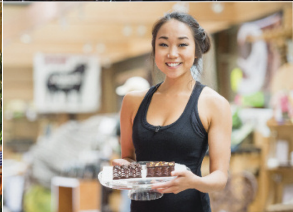
Clockwise from top left: Prairie River Cruises, Village Guitar & Amp Co., Saskatoon Farmers' Market, Drift Sidewalk Café

Tourism Saskatchewan's spring television and online advertising campaign was launched on April 10 in Saskatchewan and Alberta. The television component had a two-month run, while online promotion ended June 18. A new television commercial, edited in 30-second and 60-second versions, alternated with an existing spot created for the 2016 spring advertising campaign. The new commercial, filmed in Saskatoon, has an urban flavour and was designed to appeal to millennial travellers (born between 1980 and 1996). The alternating commercial is set in Prince Albert National Park (PANP) and focuses on family camping.