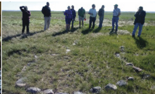
History and photography tour of Mankota/Grasslands National Park