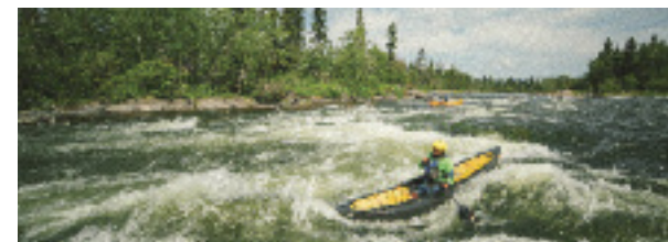
Facing Waves paddles the Churchill River

The 2017 Saskatchewan Whitewater Festival takes place from June 30-July 2.