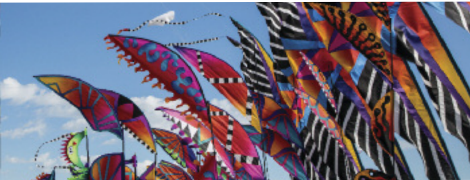
SaskPower Windscape Kite Festival, Swift Current