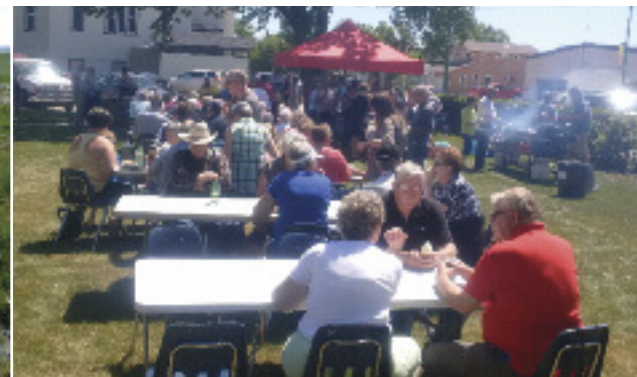
Saskatchewan Tourism Week barbecue, Watrous

Communities throughout Saskatchewan celebrated Saskatchewan Tourism Week with nearly 20 events. Public barbecues, community tours, flag-raising ceremonies, open houses, and contests and promotions acknowledged the week that was officially proclaimed by the Government of Saskatchewan.