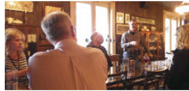
AWeshop evening hosted at Solar Gardens, The Living Art Company

Participants embraced their role as travellers and witnessed experiential tourism in action during a Fired Up Solar Supper at Solar Gardens, the Living Art Company. The evening was hosted in partnership with Black Fox Farm & Distillery. Both businesses are located outside of Saskatoon, and offer authentic experiences that showcase Saskatchewan products.