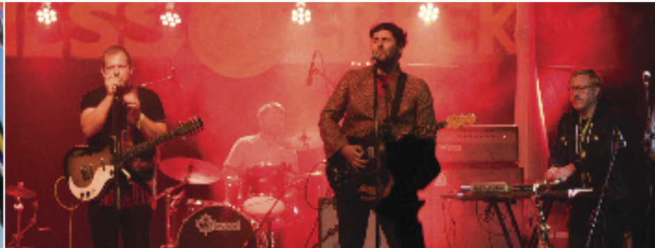
Ness Creek Music Festival, Big River

Tourism Saskatchewan piloted Getting Your Event Off the Ground, the first component in its series of event planning workshops, on April 28 in Regina. Invitations to participate were sent to a number of community-based tourism events. Sixteen participants were on hand for the half-day session, and represented the following: Calling Lakes Brand Development Committee (Fort Qu'Appelle), City of Humboldt, City of Regina, Fête Fransaskoise Festival/Conseil cultural fransaskois, Living Sky Casino (Swift Current), Mid Summer's Art Festival (Fort Qu'Appelle), Painted Hand Casino (Yorkton), Parks Canada/Batoche National Historic Site, Saskatchewan Broomball Association, Saskatchewan Cycling Association, Skate Canada - Saskatchewan and The Caring Place (Regina).